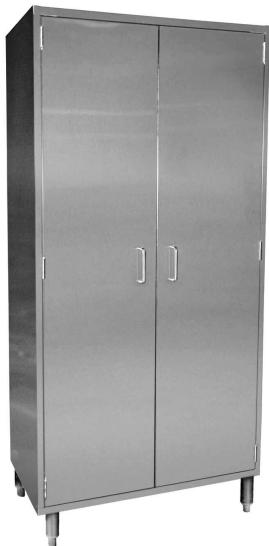
#SSC-TSC-1836 stationary unit

All stainless steel type 304 enclosed cabinet. Four adjustable shelves, 18" or 24"-deep by 36"- or 48"-long. Available with sloped top for laminar flow.