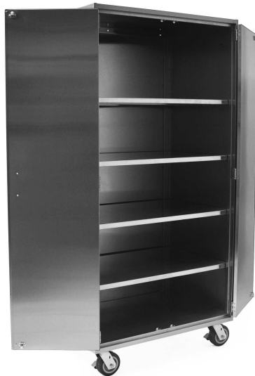
#SSC-TSC-2436-CPB mobile unit