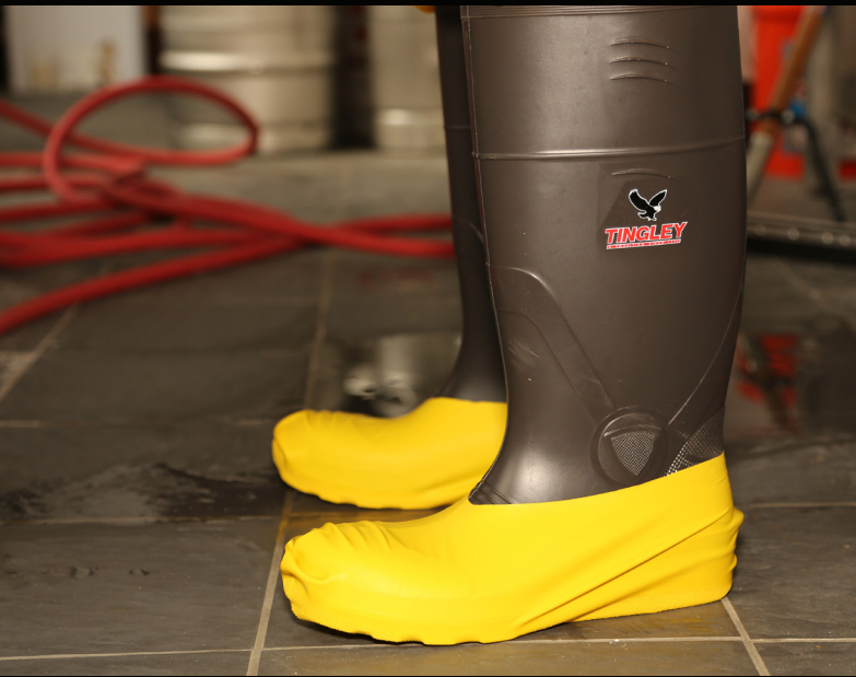
Boot Saver shoe covers are perfect for the color coded world of food processing by helping prevent cross-contamination.